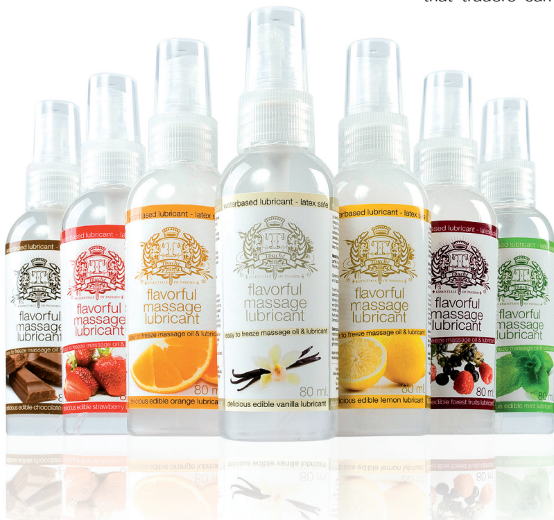
The diverse freezable lubricants now come in seven different edible flavours

These are another example of a product portfolio that has a little something for every taste. If you would like to find out more you can visit the company website at www.shotsmedia.nl or send an e-mail to info@shotsmedia.nl . At www.shotsmedia.nl/b2b traders can request quick and easy access to the internet presence.