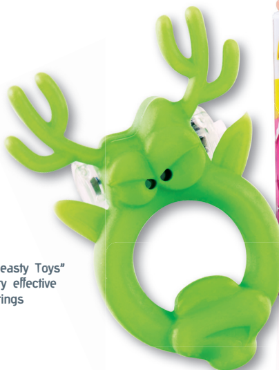
The "Beasty Toys" are very effective penis rings

A good portion of colour is introduced by Shots Media with their assortment of silicone rings. But the choice has to be made with care, because in the erotic world, the colour can have a specific meaning, which may send a subtle message to someone the wearer may meet. So singles who fancy a bit of sex should wear a red ring. Similar intentions but another relationship status is expressed with a white ring. Those who are just on the lookout for someone to talk to should wear a black one. The violet, turquoise and pink rings are not really for verbal communication, but they still look great on a chain.