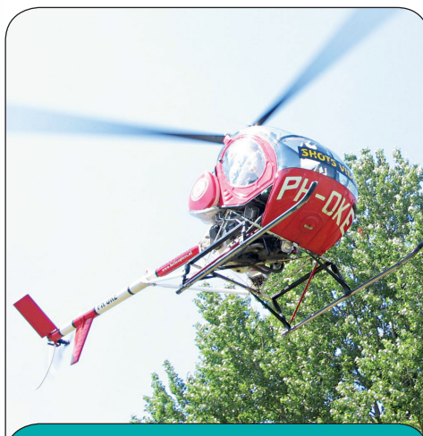
The Shots Video chopper offered a bird's eye view of the party

Because of this, the Dutch authorities decided to cancel the remaining three days of walking due to the increased health risk.