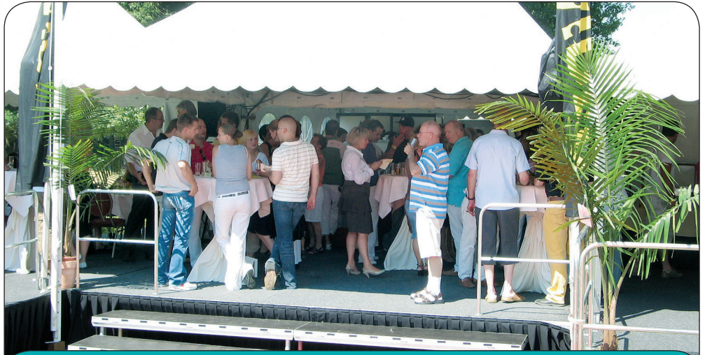
The cool Caribbean flair was enjoyed by all

Around 65.000 sports people, amateurs, military personnel and other interested parties from all over the globe get together in Nijmegen to walk up to 50 kilometres per days for five days. The event began the day before the Shots party on the 18th of July with a high attendance and also some high temperatures, but the walk, which should have been accompanied with good spirits turned out to become a local tragedy.